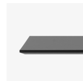
→ Nero Ingo Fenix Nano laminate