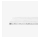
→ Bianco Carrara Marble