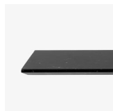
→ Nero Marquina Marble