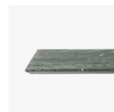
→ Verde Guatemala Marble