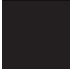
Polished black Nero Marquina marble