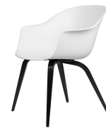
// Stained Beech