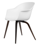
// Smoked Oak