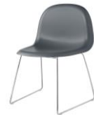
// Midnight Grey