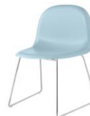
// Blue Morning