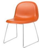
// Orange Sweet