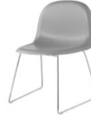
// Misty Grey