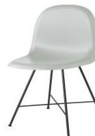
// Nightfall Blue