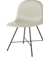
// Moon Gray