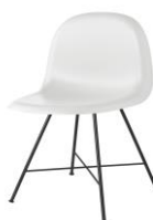
// White Cloud