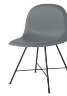
// Rainy Gray