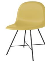
// Venetian Gold