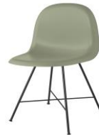
// Mistletoe Green