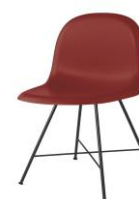
// Shy Cherry