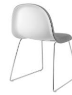
// White Cloud