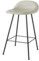
// Moon Gray