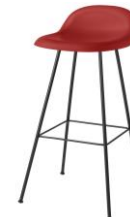
// Shy Cherry