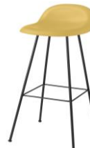
// Venetian Gold