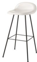
// White Cloud