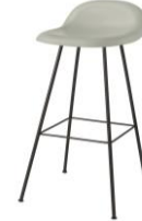
// Nightfall Blue