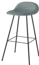
// Rainy Gray