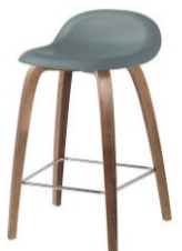
// Rainy Gray