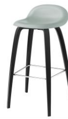
// Nightfall Blue