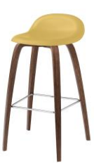
// Venetian Gold