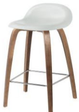
// White Cloud