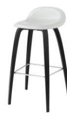
// White Cloud