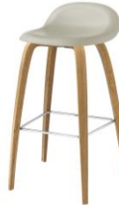
// Moon Grey