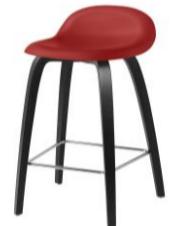
// Shy Cherry