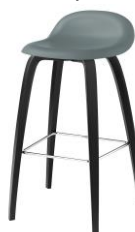
// Rainy Grey