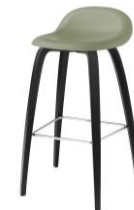
// Mistletoe Green