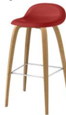
// Shy Cherry