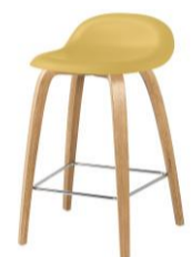
// Venetian Gold