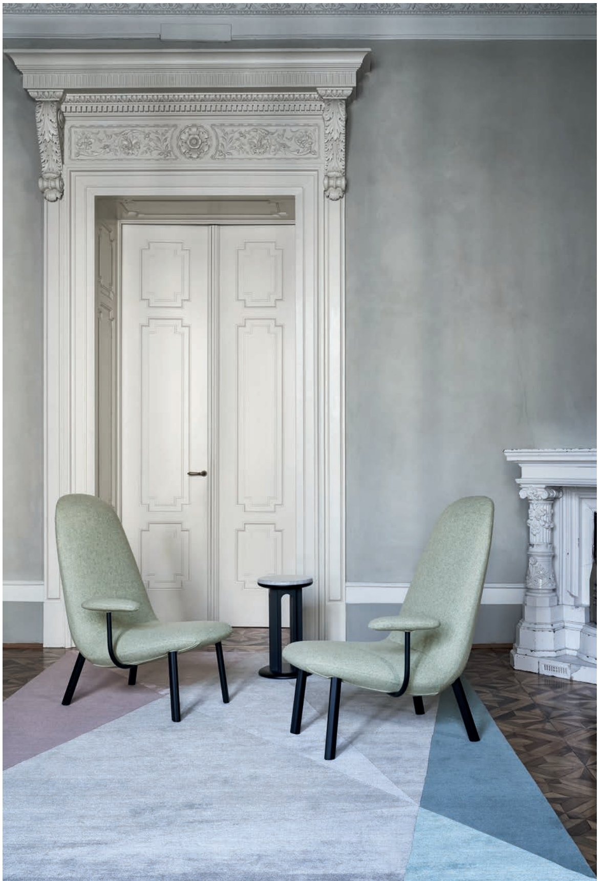
Leafo armchair Arcolor small table