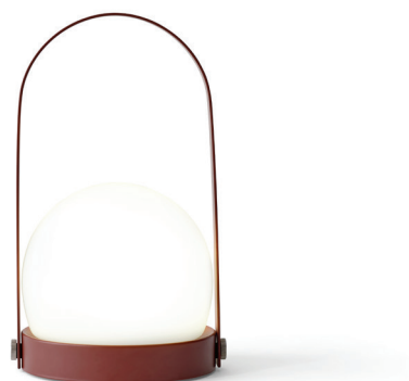
Burned Red 4863349