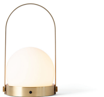
Brushed Brass 4863839